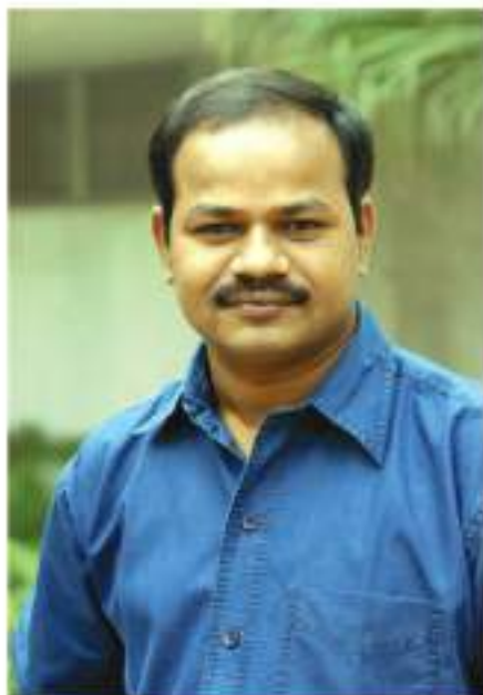
Hyderabad to Delhi Via MUMBAI

I n the year 2005, I was deputed on the job to cover the Mumbai floods. In actuality, another reporter was supposed to be assigned that job but he had denied undertaking that task. To the best of my abilities, I had justified the task given to me – presented the Mumbai flood stories in the best possible way. The news story of the drainage water being utilized as the drinking water had shaken the CEO of the TV-9 channel, Ravi Prakash. I had an interview with the then Chief Minister of Maharashtra, Vilas Rao Deshmukh. All these factors have become the crucial factors for my absorption to Delhi Bureau. No sooner I had reported at Delhi than I had successfully covered various significant stories such as Kashmir's earthquake, the Prime Minister's Andaman tour, Elections in North India, Parliament coverages, and most importantly the crucial moves being made in the national capital Delhi about the Telangana agitation.